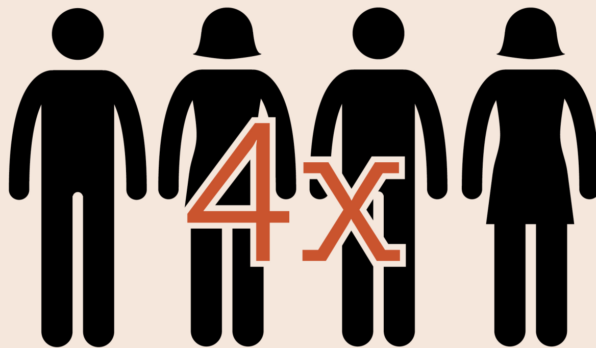
Aboriginal & Torres Strait Islander people