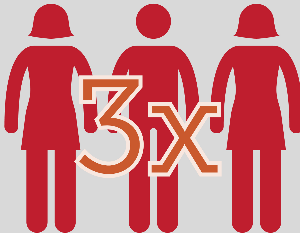
Aboriginal & Torres Strait Islander people